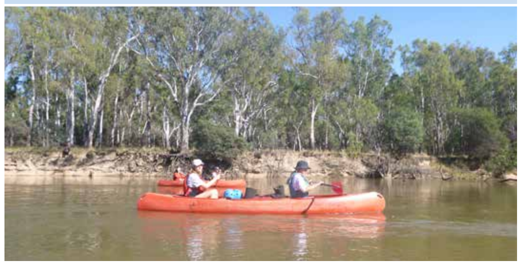
"I am the master of my fate and the captain of my soul."

It is a very exciting time for Year 10 girls who have been offered four amazing Beyond Boundaries experiences in Term 4. Through giving the girls ownership to choose their own challenge we are empowering them to push their own personal boundaries and enjoy experiences full of lifelong learning that cannot be taught in the classroom setting.