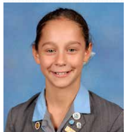
2 Senior Girls A Grade Tennis Team