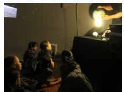
Year 3 students explored night and day at the inflatable Star Lab Dome as part of their Science Unit of investigation