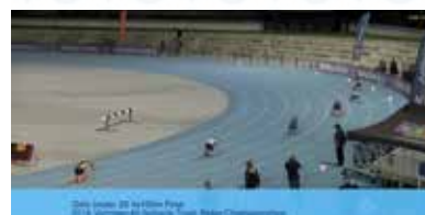
Click here to watch footage of the Under 20 Girls 4x100m Relay race at the All Schools State Relay Championships