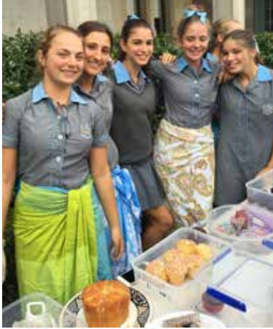
Year 10 students organised a cake stall for International Women's Day with funds donated to village schools in Fiii