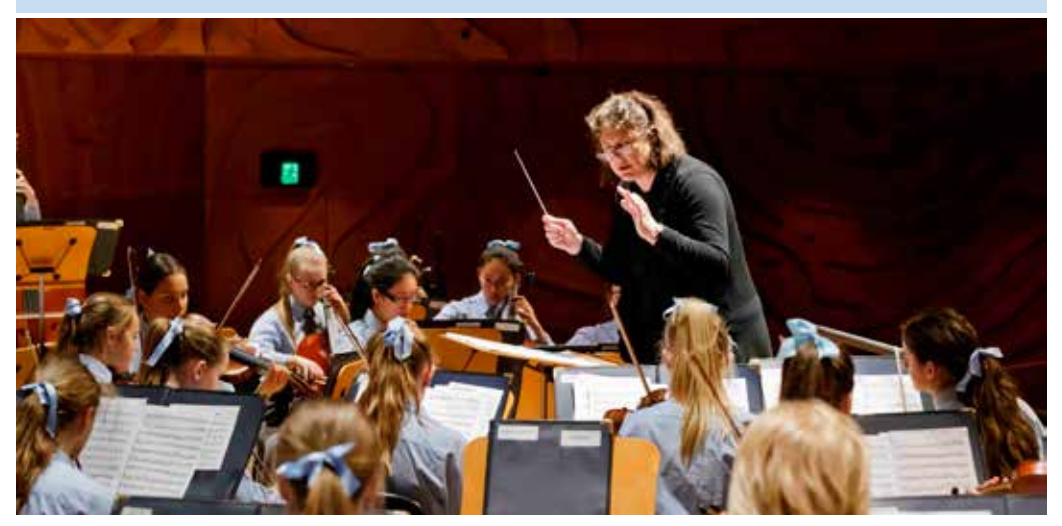
The Juggling Act of Rehearsals

I must admit it has been quite challenging to organise all our girls together to rehearse. However, the use of recordings on mystcatherines has allowed Senior students to learn their parts in their own time.