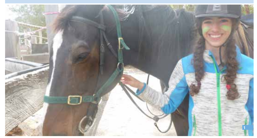
"Children today are over protected, over competitive, over programmed, over busy and over pressured... The most crucial life skill required for our young people in the future is adaptability."