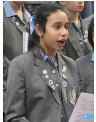
1 Anzac Assembly