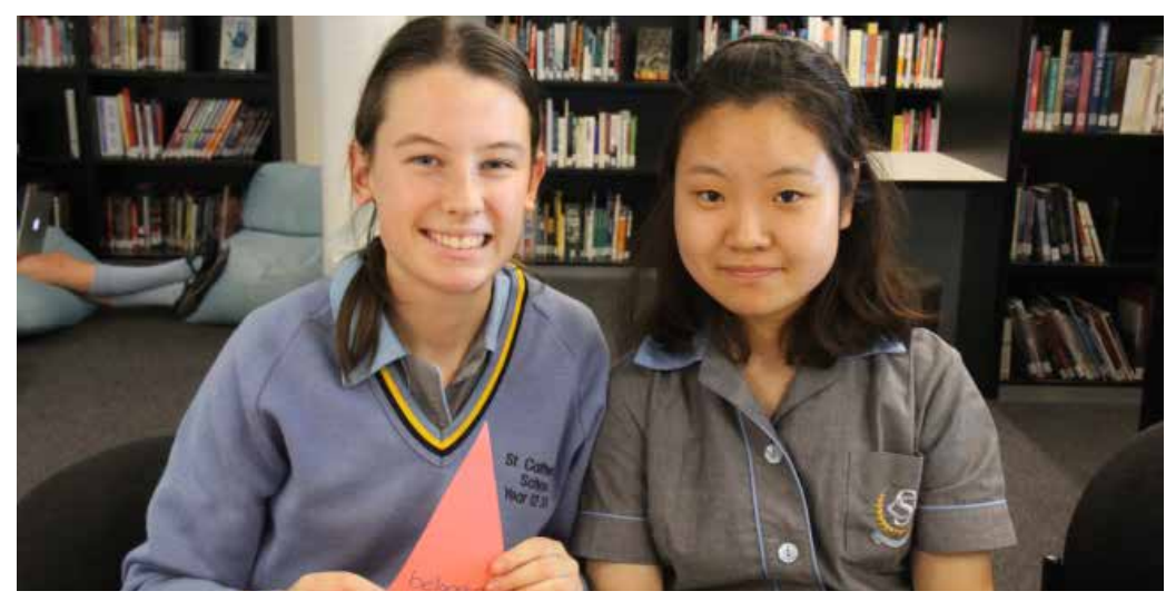
Our Diversity is our Strength

'Harmony Day recognises the importance of celebrating our cultural heritage and sharing it with others, building our understanding of other cultures, our differences, our similarities and our shared values.'[1]